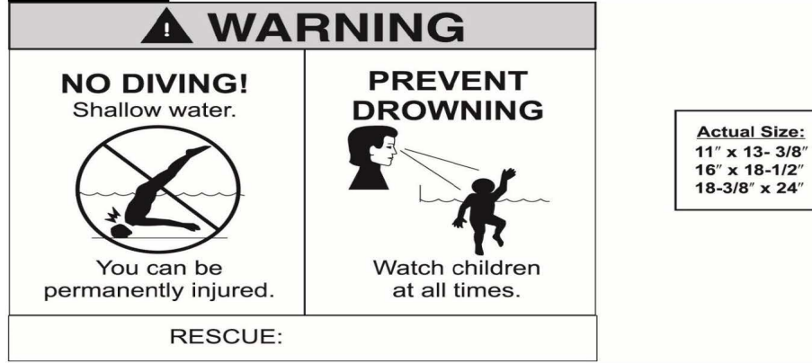
FIGURE 2. SIGNAGE