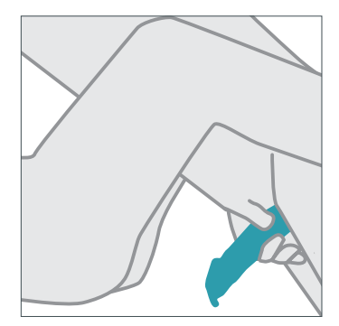
After sex but before pulling out, hold the condom at the base. Then pull out, while holding the condom in place.