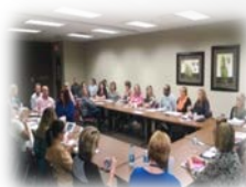
Table of Contents McCurtain County Community Health Status Assessment 2014