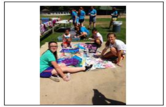
The presentation concluded.