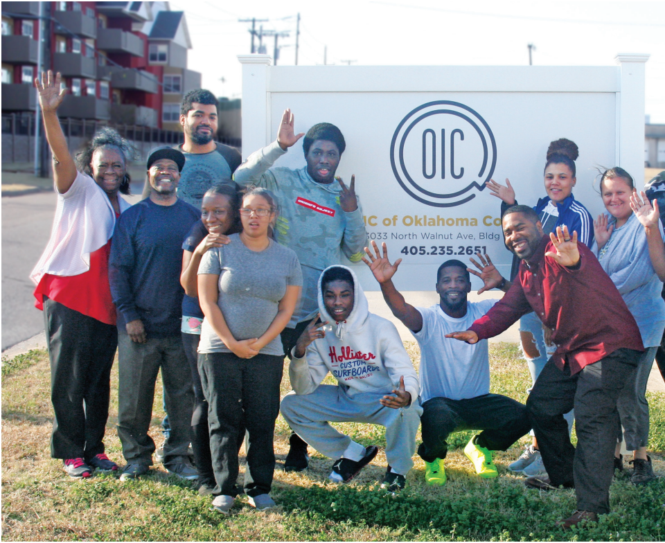
Learners, tutors, and staff representing OIC of Oklahoma County