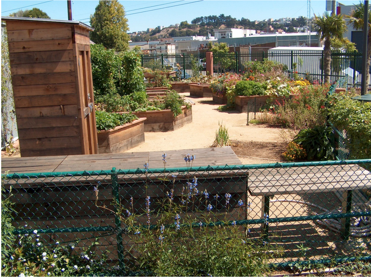
Figure 3: Treat Commons Community Garden, San Francisco, CA