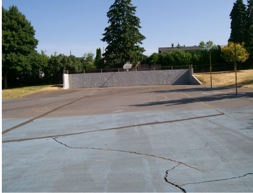
Figure 2: Frazer Park Garden Site Pre-Construction