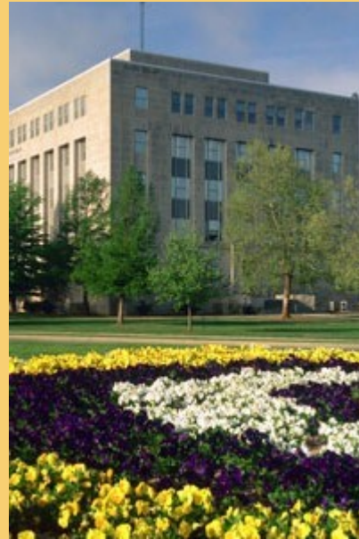
Oklahoma Corporation Commission Public Utility Division Tel: 405-521-2331

For assistance, contact us at (405) 521-2331 or email us at OUSF@occ.ok.gov