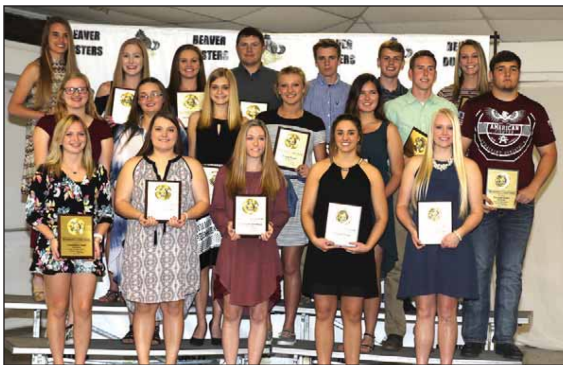
HONOR KIDS - Pictured are juniors and seniors who have a cumulative 3.5 GPA overall in their academic progress.