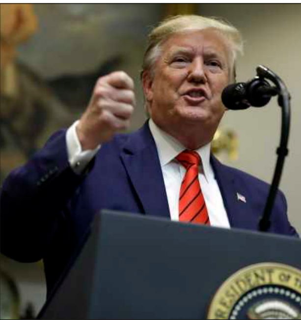
President Donald Trump answers questions from reporters during an event on "transparency in Federal guidance and enforcement" in the Roosevelt Room of the White House Wednesday in Washington.

The intelligence panel, along with the Foreign Affairs and Oversight and Government Reform panels, subpoenaed Gordon Sondland, the U.S. European Union ambassador, on Tuesday after Trump's State Department barred him from showing up at a scheduled deposition. Texts provided by another diplomat last week showed Sondland and others navigating Trump's demands for investigations as they spoke to Ukrainian government officials about a possi-