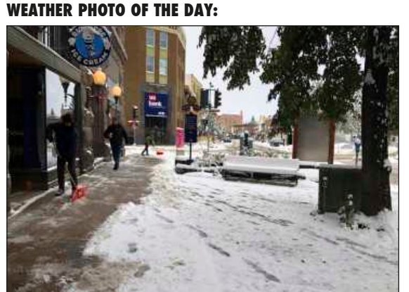
WEATHER PHOTO OF THE DAY: People clear the sidewalk after a fall snowstorm Wednesday in Helena, Mont.

GOT A WEATHER PHOTO? SUBMIT IT AS OUR PHOTO OF THE DAY. INCLUDE NAME, HOMETOWN AND PHOTO LOCATION. SEND THE 3-INCH-WIDE BY 2-INCH-DEEP, 200 RESOLUTION, .JPG PHOTO TO ENIDNEWS@ENIDNEWS.COM.