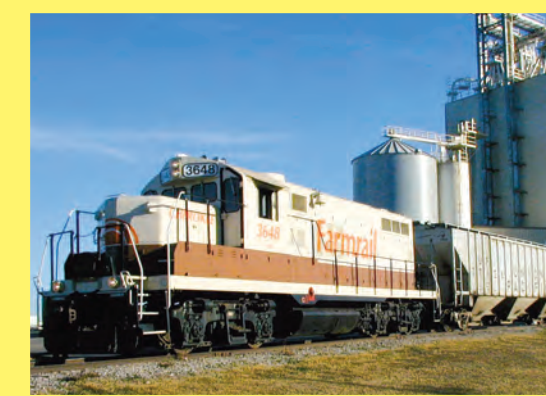
In 2013 they purchased the Sunbelt Line they'd leased for decades. cranes work the barges. The BNSF and SKOL provide rail access.