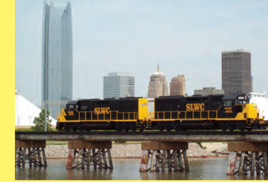
north of Guthrie, Oklahoma. The BNSF is one of the largest railways in the U.S., crossing more than half the counties in our approach uses 100+ cars to optimize fuel, car usage and destination. The substitute of Guthrie, Oklahoma and Arkansas out of Missouri and Kansas. The substitute of Guthrie, Oklahoma and Arkansas out of Missouri and Kansas. The substitute of Guthrie, Oklahoma and Arkansas out of Missouri and Kansas. The substitute of Guthrie, Oklahoma and Arkansas out of Missouri and Kansas. The substitute of Guthrie, Oklahoma and Arkansas out of Missouri and Kansas. The substitute of Guthrie, Oklahoma and Arkansas out of Missouri and Kansas. The substitute of Guthrie, Oklahoma and Arkansas out of Missouri and Kansas. The substitute of Guthrie, Oklahoma and Arkansas out of Missouri and Kansas. The substitute of Guthrie, Oklahoma and Arkansas out of Missouri and Kansas. The substitute of Guthrie, Oklahoma and Arkansas out of Missouri and Kansas. The substitute of Guthrie, Oklahoma and Arkansas out of Missouri and Kansas. The substitute of Guthrie, Oklahoma and Arkansas out of Missouri and Kansas. The substitute of Guthrie, Oklahoma and Arkansas out of Missouri and Kansas. The substitute of Guthrie, Oklahoma and Arkansas out of Missouri and Kansas. The substitute of Guthrie, Oklahoma and Arkansas out of Missouri and Kansas. The substitute of Guthrie of Oklahoma and Arkansas out of Oklahoma and Arkansas out of Oklahoma and Arkansas out of Oklahoma and Arkansas out of Oklahoma and Arkansas out of Oklahoma and Arkansas out of Oklahoma and Arkansas out of Oklahoma and Arkansas out of Oklahoma and Arkansas out of Oklahoma and Arkansas out of Oklahoma and Arkansas out of Oklahoma and Arkansas out of Oklahoma and Arkansas out of Oklahoma and Arkansas out of Oklahoma and Arkansas out of Oklahoma and Arkansas out of Oklahoma and Arkansas out of Oklahoma and Arkansas out of Oklahoma and Arkansas out of Oklahoma and Arkansas out of Oklahoma and Arkansas out of Oklahoma and Arkansas out of Oklahoma and state and serves as the host railroad to Amtrak's Heartland Flyer. tion options for the most economic means of transporting freight. Gulf of Mexico with Oklahoma's eastern cities and forest industry. Snyder to Mustang connecting through OKĆ to the SKOL in Tulsa.