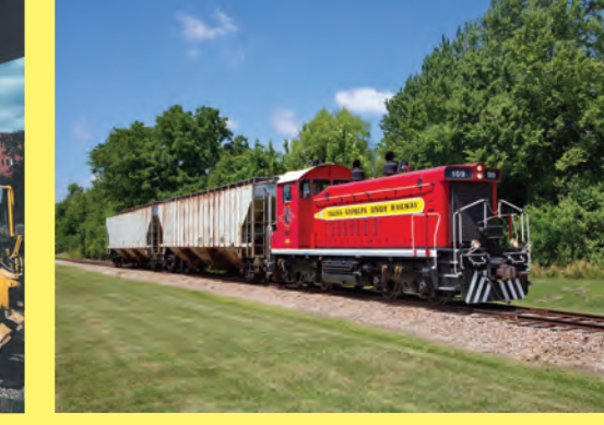
parallel to one of America's most famous highways - U.S. Route 66. the Dallas/Fort Worth area and cities in northeastern Texas. ran from Texas across the Red River to the tip of the panhandle. allows Oklahoma access to the growing world transport market.