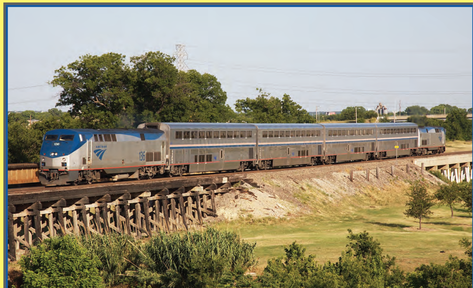
The Heartland Flyer making its way between Oklahoma City and Fort Worth. The Heartland Flyer had 68,744 riders in 2019. The Heartland Flyer makes a daily round trip between Oklahoma City and Fort Worth, Texas with stops at Norman, Purcell, Pauls Valley, Ardmore, and Gainsville seven days a week. FOR RESERVATIONS: 1-800-USA-RAIL OR AMTRAK.COM FOR INFORMATION AND EVENTS: WWW.HEARTLANDFLYER.COM