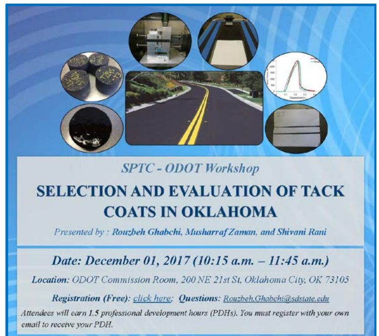
Figure 2. Flyer announcing Workshop to be held at ODOT

The OTL also assists ODOT in making the SP&R Final Reports compliant with accessibility standards under the Americans with Disabilities Act.