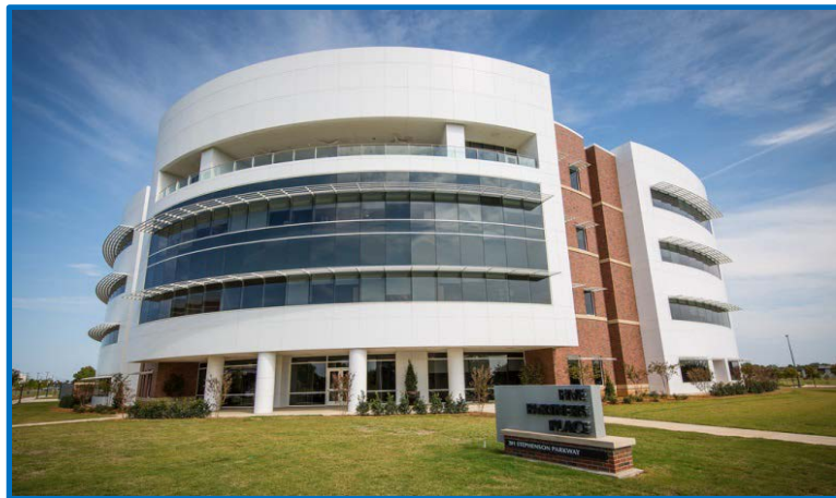
Figure 1. The Oklahoma Transportation Library

The Oklahoma Department of Transportation (ODOT) seeks to maintain and operate a sound, progressive, and flexible transportation library, which is available to users at ODOT as well as users throughout the transportation community. The OTL is located at The University of Oklahoma (OU), Norman Research Campus, at Five Partners Place, Suite 4200.