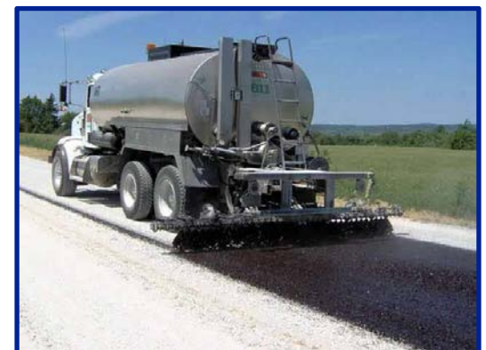
Figure 5. Application Method (affects uniformity)