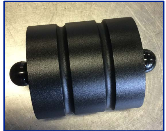
Figure 1. Tracking Paint Drying Time Wheel

In order to conduct the tracking test specified in this study, researchers obtained a Tracking Paint Drying Time Wheel Device.