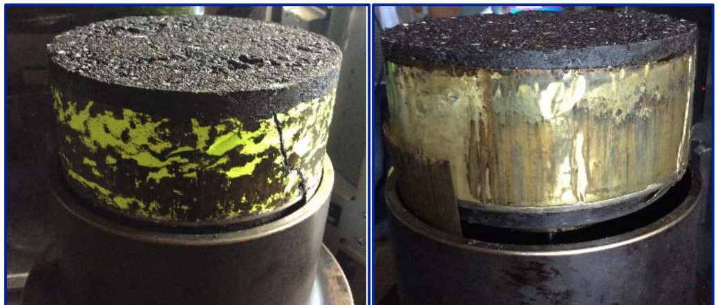
Figure 2. Asphalt Mix Samples Compacted using Card Board and Metal Strips