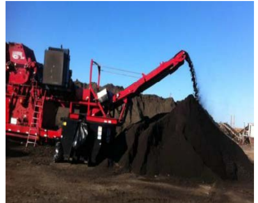
Figure 1 Processing Tear-Off RAS

RESULTS In this study, a comprehensive survey was conducted among the state departments of transportation (DOTs) to determine current practices, including the methods and specifications associated with the use of RAS and RAP in pavements. Thirty agencies responded to this survey. The results revealed that about 50% of the DOTs use RAS in asphalt mixes. These agencies use both tear-off and manufacturer's waste; however, a majority of these agencies prefer using manufacturer's waste. Figure 1 shows processing tear-off RAS in a local asphalt plant.