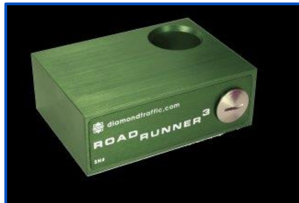
Figure 1. Road Runner 3 used for collecting data

Innovative Traffic Systems & Solutions (ITSS), LLC has developed the TCMS for providing web services. The TCMS is composed of Android applications running on tablets and web services provided by the TCMS server.