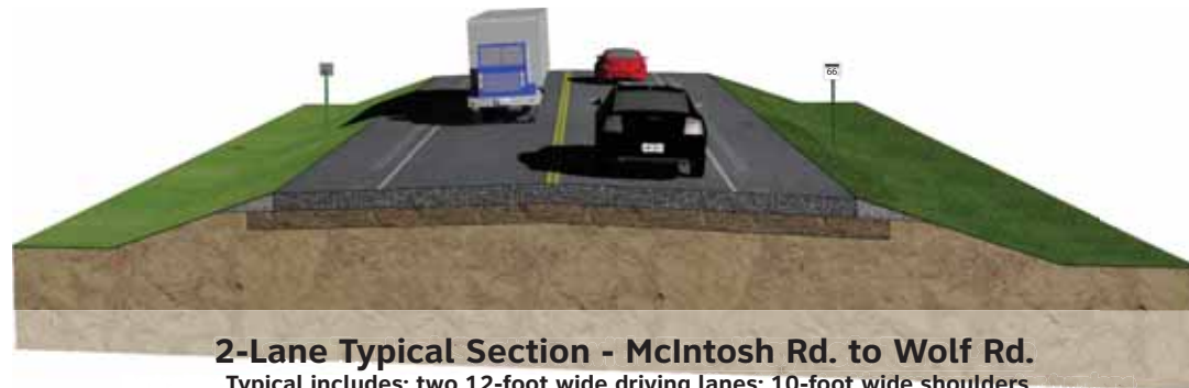
2-Lane Typical Section - McIntosh Rd. to Wolf Rd. Typical includes: two 12-foot wide driving lanes; 10-foot wide shoulders

For additional information please contact: