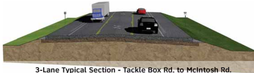
3-Lane Typical Section - Tackle Box Rd. to McIntosh Rd. Typical includes: two 12-foot wide driving lanes; 14-foot wide turn lane; 10-foot wide shoulders