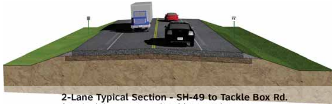
2-Lane Typical Section - SH-49 to Tackle Box Rd. Typical includes: two 12-foot wide driving lanes; 10-foot wide shoulders