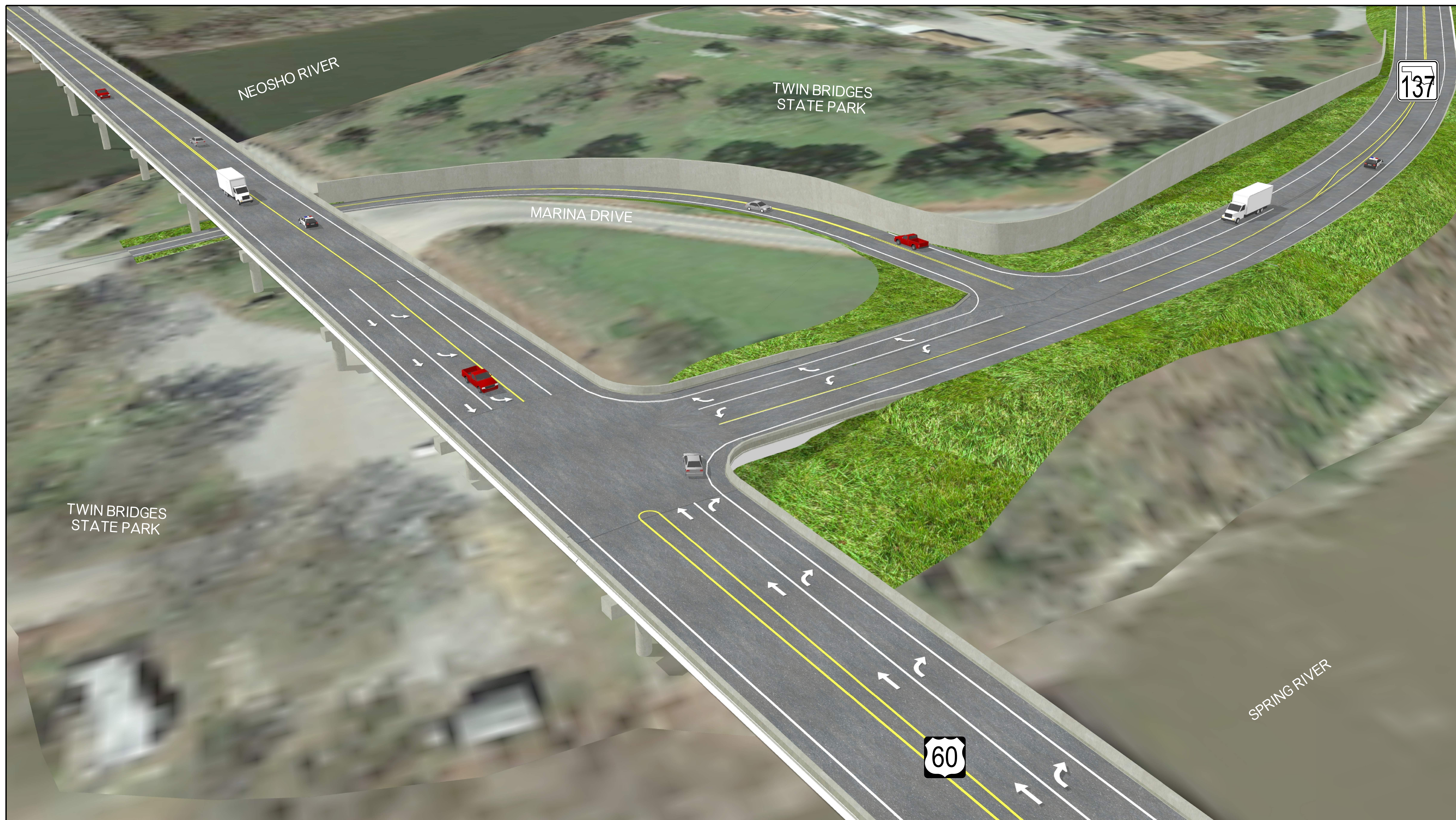
VIEW FACING NORTHWEST AT US-60/SH-137 INTERSECTION