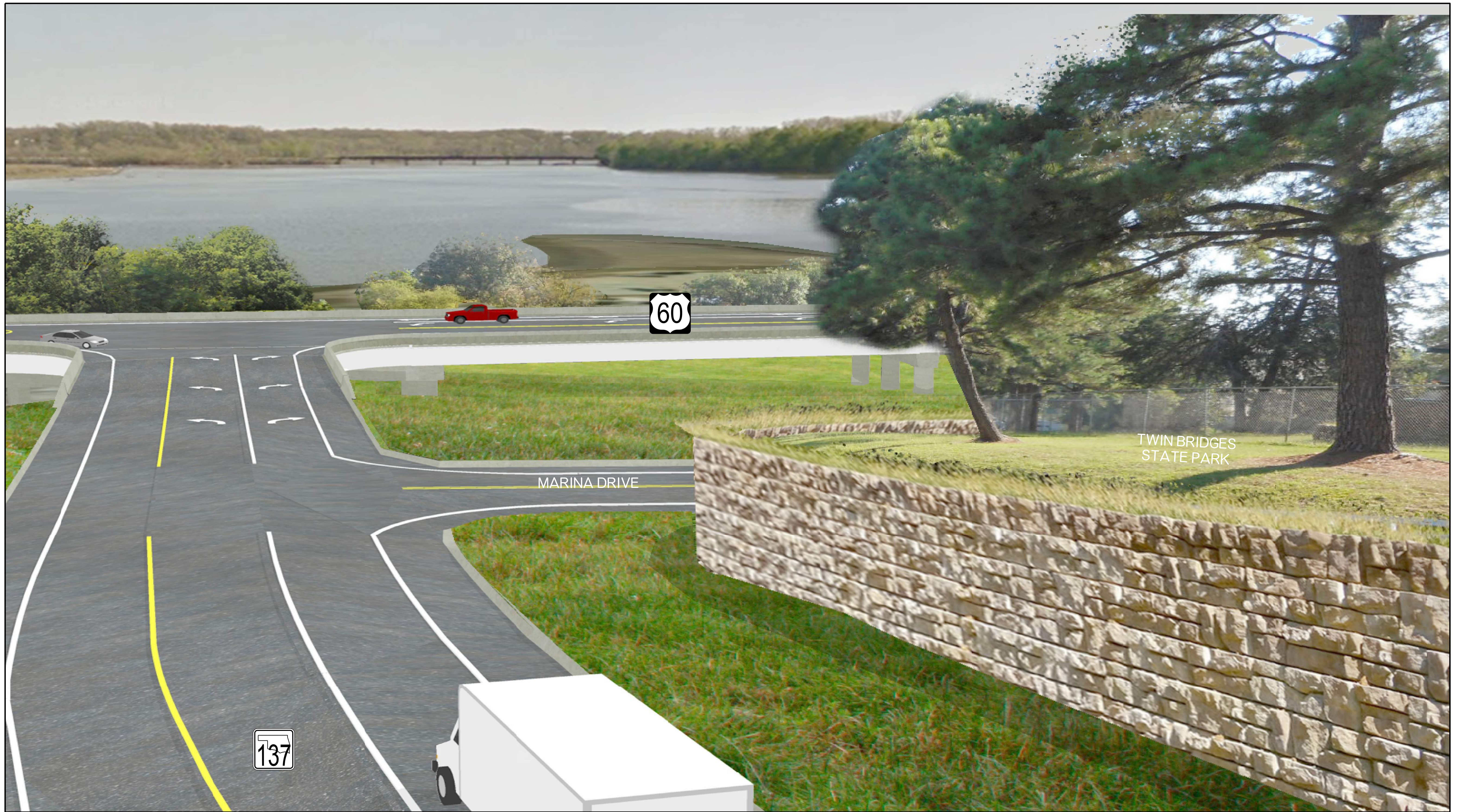
VIEW FACING SOUTH FROM SH-137 TOWARDS US-60