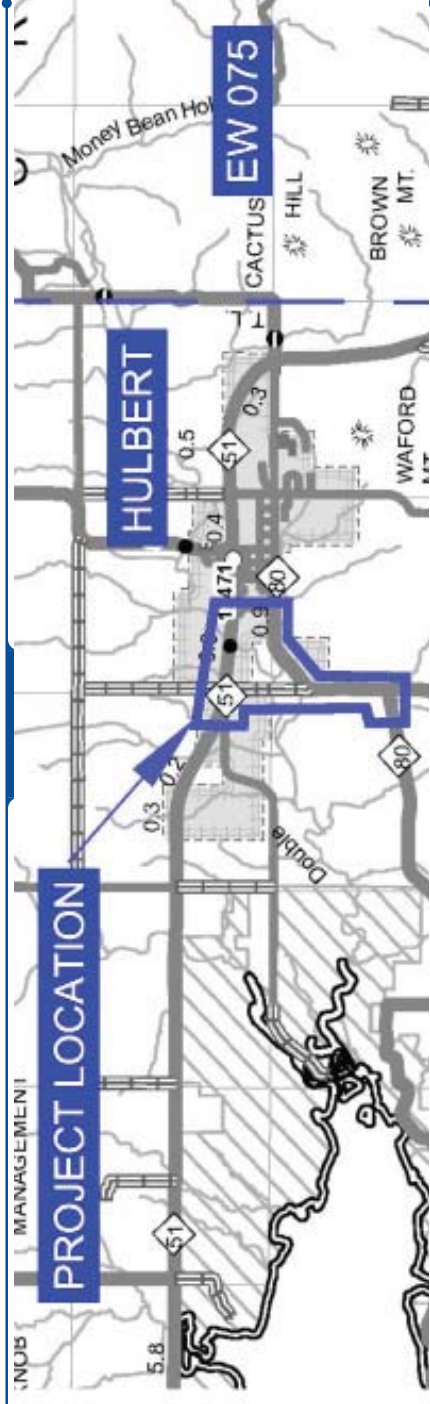
*Vary based on location