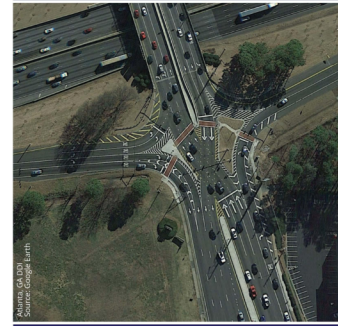
Author: DOT Source: Google Earth

AN INNOVATIVE, PROVEN SOLUTION FOR IMPROVING SAFETY AND MOBILITY AT INTERCHANGES