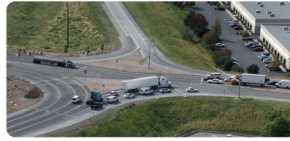
Trucks Using a DDI in Salt Lake County, UT

ability of trucks to turn on to and off of the ramps and navigate along the crossroad is not inhibited with a DDI. In surveys of commercial drivers using the Springfield (Missouri) DDI, 83 percent of respondents felt that maneuvering a large truck through the interchange was easy and no different from other interchange types. 5