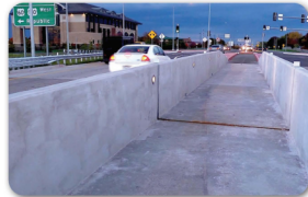
Center Pedestrian Refuge, Springfield, MO DDI

Given the importance of freight movement through interchanges, a DDI also is designed to accommodate large commercial vehicles. The