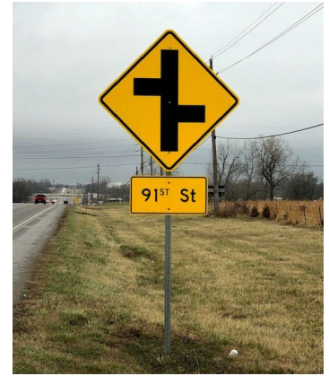
Existing street sign showing offset intersection

ODOT proposes to realign the intersections of E. 91st Street and E. Washington Street with SH-51 into one intersection with a traffic signal with left turn arrows. Dedicated left turn lanes with deceleration distance will be provided in both directions on SH-51 and a right turn lane will be provided for westbound traffic on E. 91st Street. Additional right-of-way will be required, but no homes or businesses will be affected. The roadways will remain open during construction and temporary pavement will be used to maintain traffic.