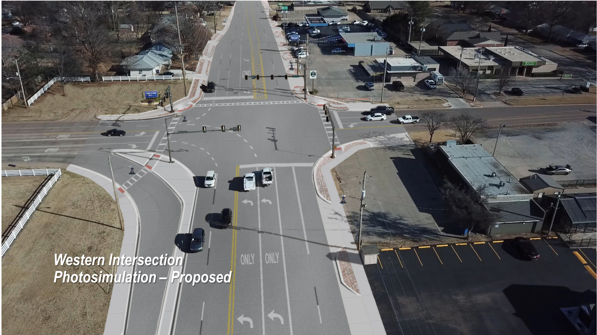
Western Intersection Photosimulation – Proposed