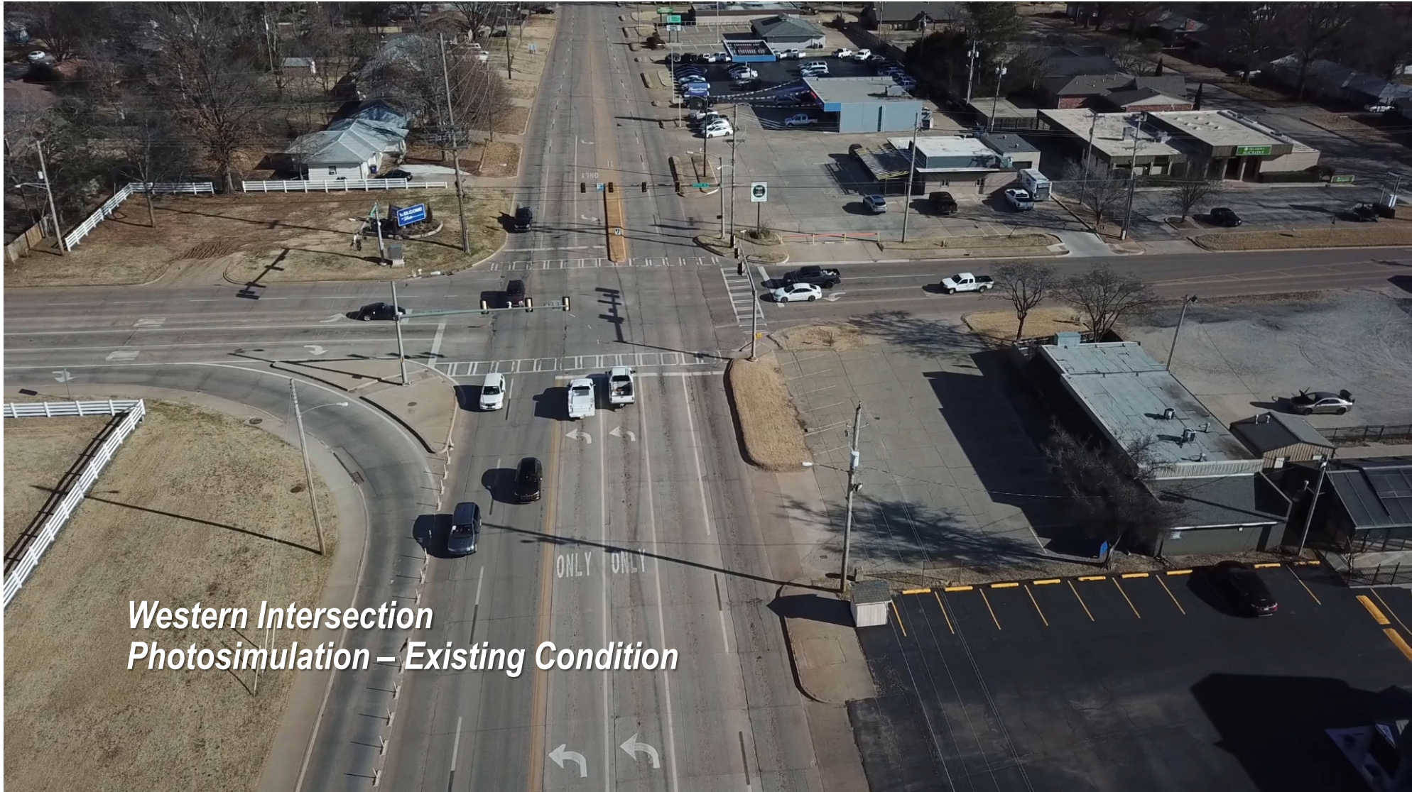
Western Intersection Photosimulation – Existing Condition