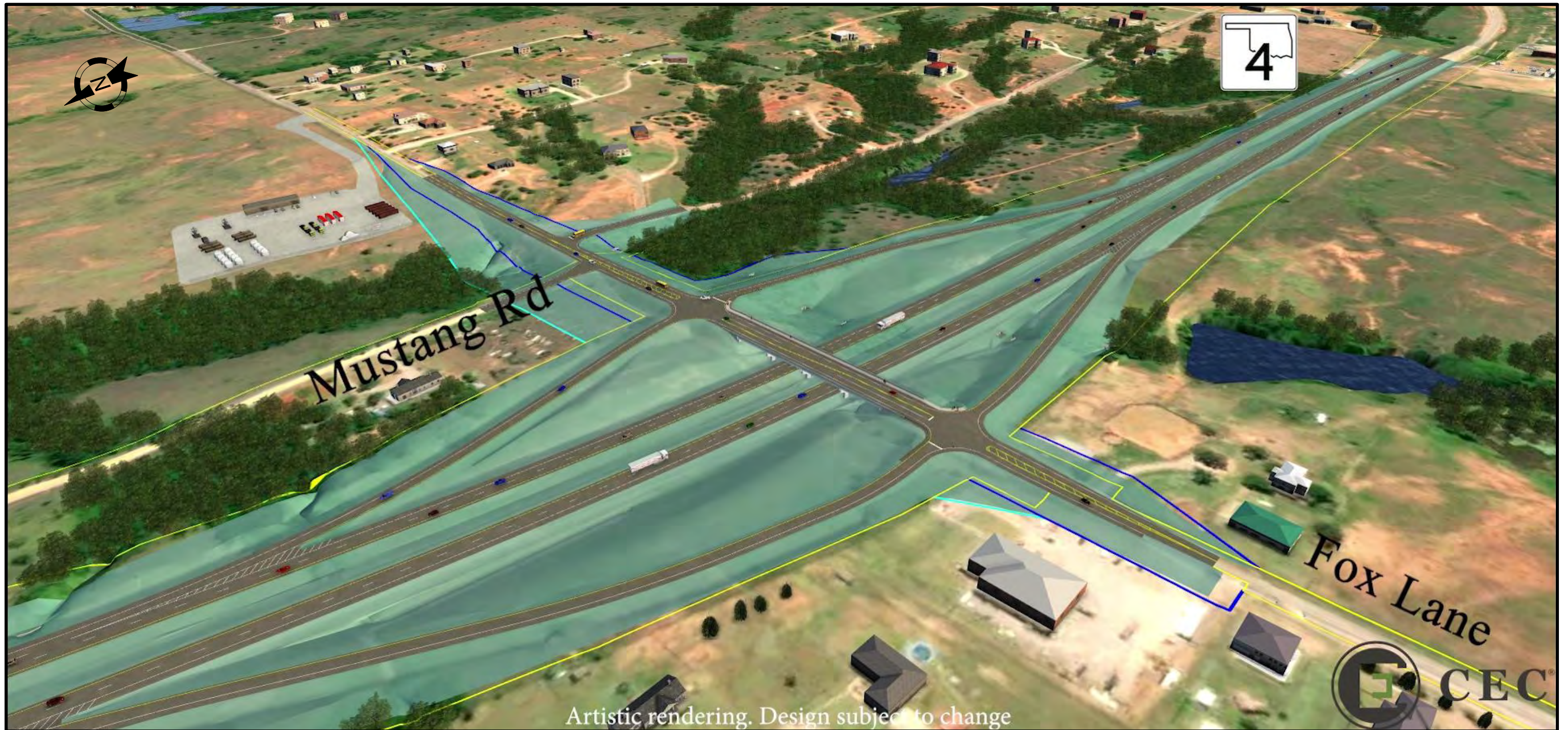
Alternative 3A2: Reconstruct Fox Lane to go over SH-4, and add northbound lanes on SH-4 to achieve a four-lane divided highway.