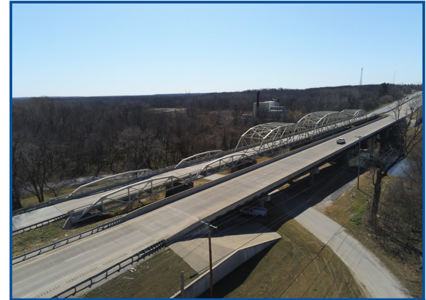
Photo: SH-66 Northbound & Southbound

Six different offset alignments were evaluated in Spring 2011, with two of the offset alignment options being removed almost immediately from further consideration for the current project (see 3(b) and 3(d) below). All of the alternatives meet the purpose and need. However, removing vehicle traffic from the historic bridge may result in an adverse effect to the bridge, nearby Rogers Point Park, or both.