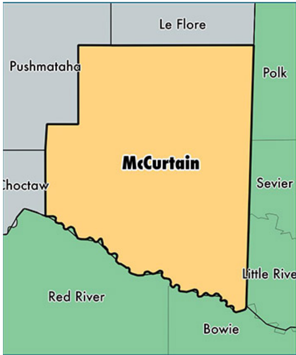
Map 1: McCurtain County, Oklahoma