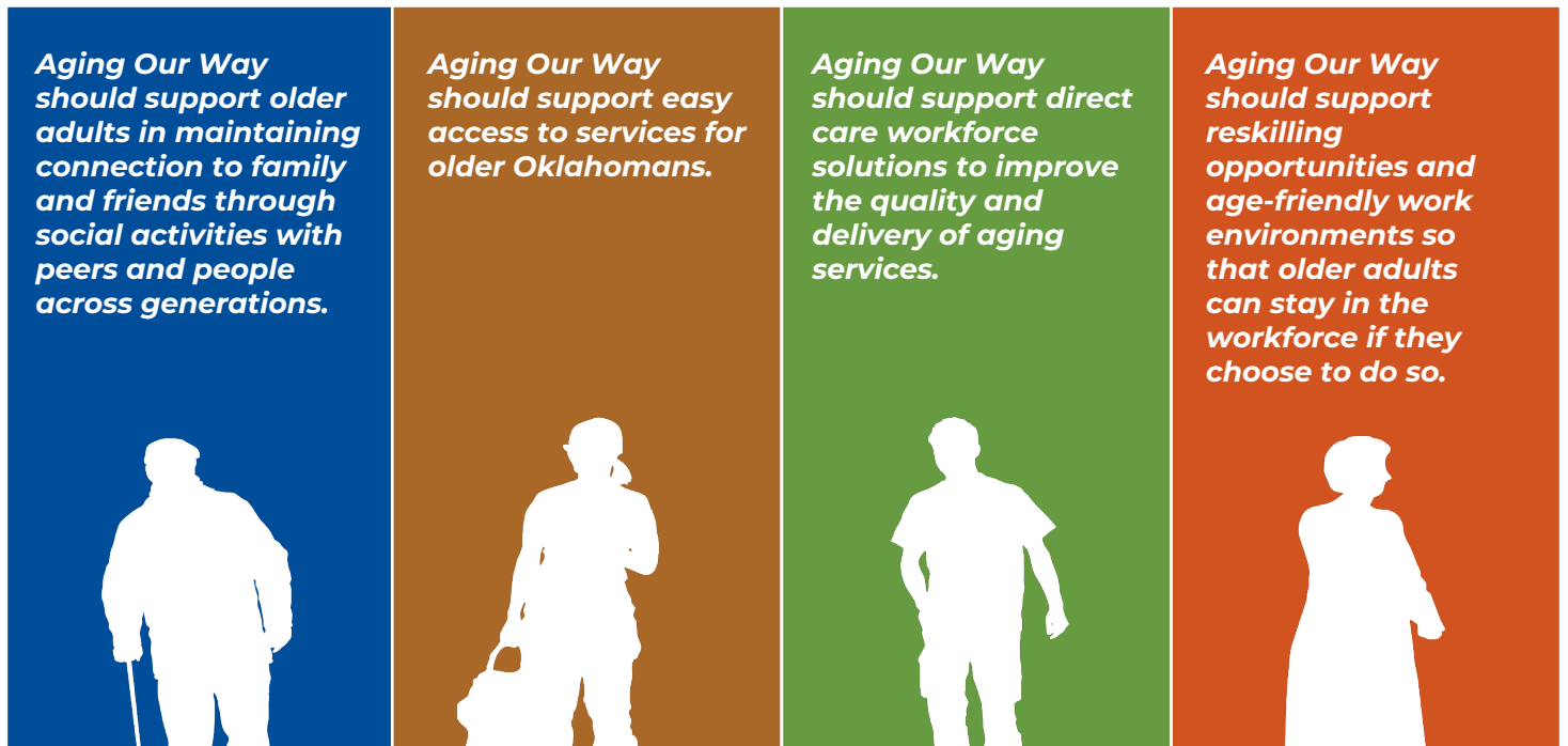
Figure 3. Aging Our Way Oklahoma Voices Key Themes