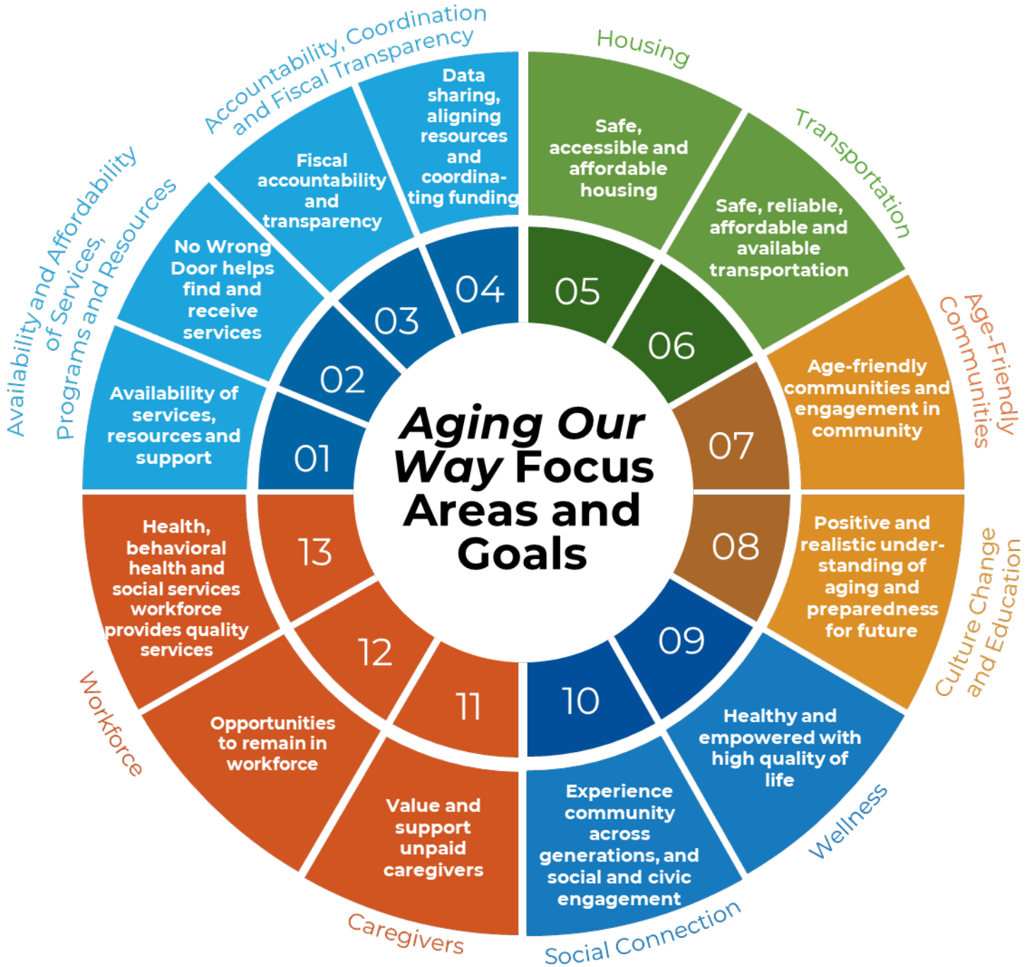
Figure 4. Aging Our Way Focus Areas and Goals

Through collaborative work sessions, Aging Our Way committee members identified 10 focus areas and 13 goals to support the healthy aging of all Oklahomans. The Aging Our Way committees developed 38 pathways to support the goals during implementation over the next 10 years.