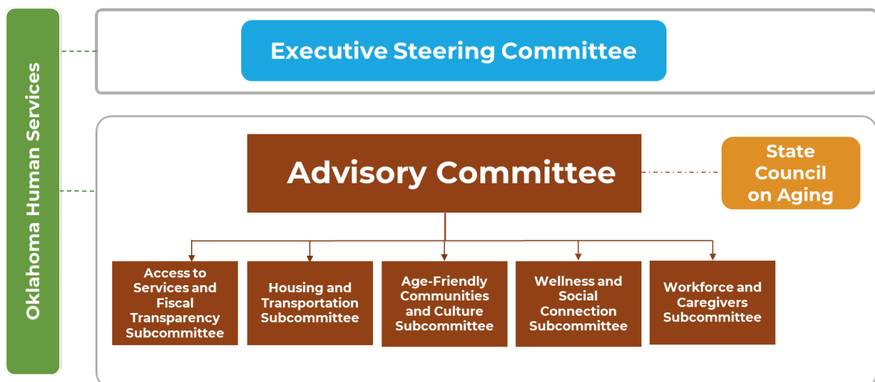
Figure 1. Aging Our Way Governance Structure

The Executive Steering Committee, Advisory Committee and Subcommittee members developed the focus areas, goals and pathways based on research and Oklahomans' perspectives. The State Council on Aging and Adult Protective Services provided further subject matter expertise, reviewing the Plan as it was developed.