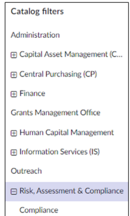
Figure 2. Catalog Filters.

Step 4: The catalog displays the choices for Risk, Assessment & Compliance.